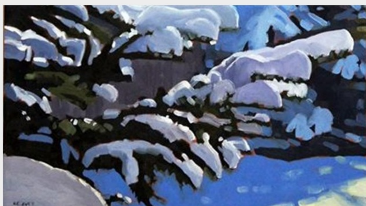
Segment of 'First Snow' by David Kelavey